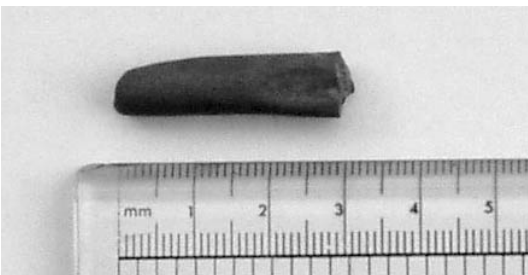
.303" bullet found at the target