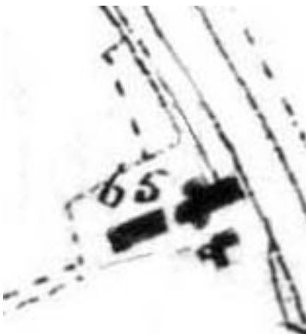
The mill in 1836